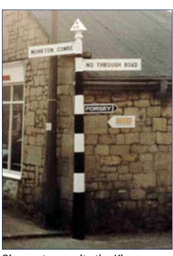
Signpost opposite the King William IV CDHS Addison Archive

Following the completion of a successful project to survey and restore milestones and turnpike markers in the parishes of Bath & North East Somerset Council in the Cotswolds Area of Outstanding Natural Beauty, it is hoped to secure funding to extend the project to include markers in our patch.