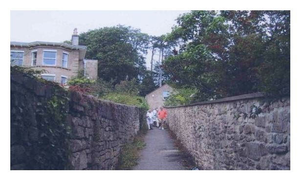
A Dringett in the Drung

Perhaps this arose because many people going up or down a drung at the same time would have squeezed, crowded or pressed past each other."