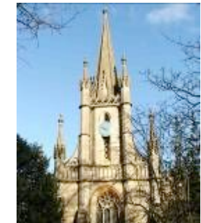
Holy Trinity - a Goodridge church

Jewish Burial Ground, 11.00am to 4.00pm. Free. Meet at the corner of Greendown Place and Bradford Road, opposite The Forester's Arms. Wednesday 15 November Combe Down Junior School, Summer Lane 7.00 for 7.30pm "Goodridge the