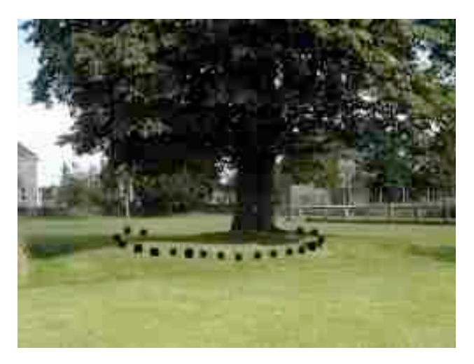
Rebuild the wall round the shaft head

The Society will be proposing to restore the circle of stones which marks the former air shaft below the chestnut tree, conserve and erect the crane (offered by Combe Grove Manor Hotel), and erect an information board to Combe Down's mining heritage