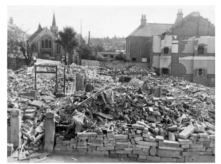
Blitzed houses in Beechen Cliff Road

1942, Bath was the target in a reprisal for the RAF bombing of Lübeck. During two nights and the following morning at the end of April, many hundreds of high explosive bombs and countless incendiary devices were dropped. The official figures show that around 900 buildings were completely destroyed and around 12,500 buildings were damaged during these raids. Over 400 people were killed, many of them women and children.