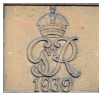
Inscription on the old telephone exchange

Our Oral History project is also catching important aspects of the past whilst they are still available since those with valuable knowledge of the early part of the last century will not remain available indefinitely! We scooped an interview with the now famous Harry Patch last year, taking him to those parts of Combe Down which he remembered so well.