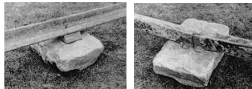
Lines and sleepers of William Smith's era – what we were looking for