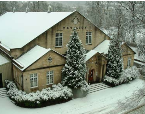
The Pavilion on a snowy February morning...

No distraction needed when I received my text from our wonderful surgery inviting me to an