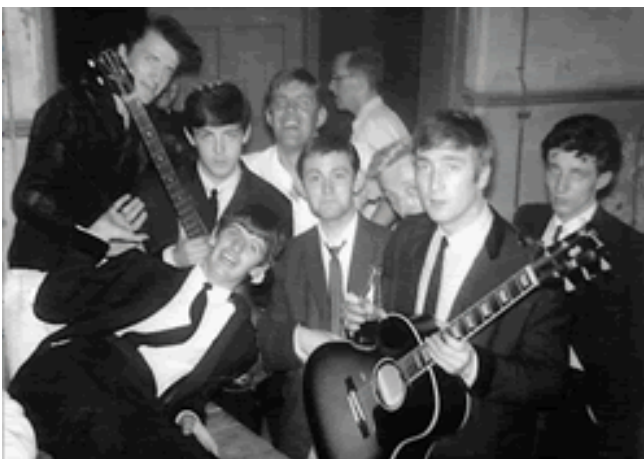
...and back in 1961 with some famous visitors.

same time, perhaps because we're all masked like bank robbers these days. But the doctor dealing with me did say that a very large number of