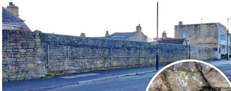
Crumbling wall looking toward the Forester & Flower next to Mulberry Way roundabout

The 'Friends' group that take care of the cemetery are about to put in an application to the Council for part of a pot of money they hold from developers (the Neighbourhood Community Infrastructure Levy, or CIL).